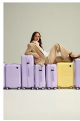
Monos. (n.d.). Monos x Magnolia Bakery Collaboration | UK Luggage, Suitcases, Bags. [online] Available at: https://monos.uk/collections/magnolia .