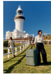
Instagram. (2020). Runaway Bay Centre on Instagram [online] Available at: https://www.instagram.com/runawaybaycentre/p/C5jvz-BL177/ [Accessed 1 Dec. 2024].