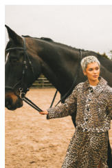
Jackson, O. (2023). New To HIP: GANNI. [online] HIP Blog. Available at: https://blog.thehipstore.co.uk/new-to-hip-ganni/ .