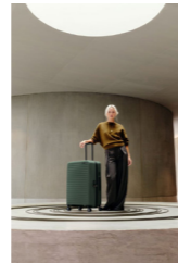
Instagram. (2020). Samsonite Australia & New Zealand on Instagram [online] Available at: https://www.instagram.com/samsonite_au/p/C_SlpZ-NN1PB/?img_index=1 [Accessed 1 Dec. 2024].